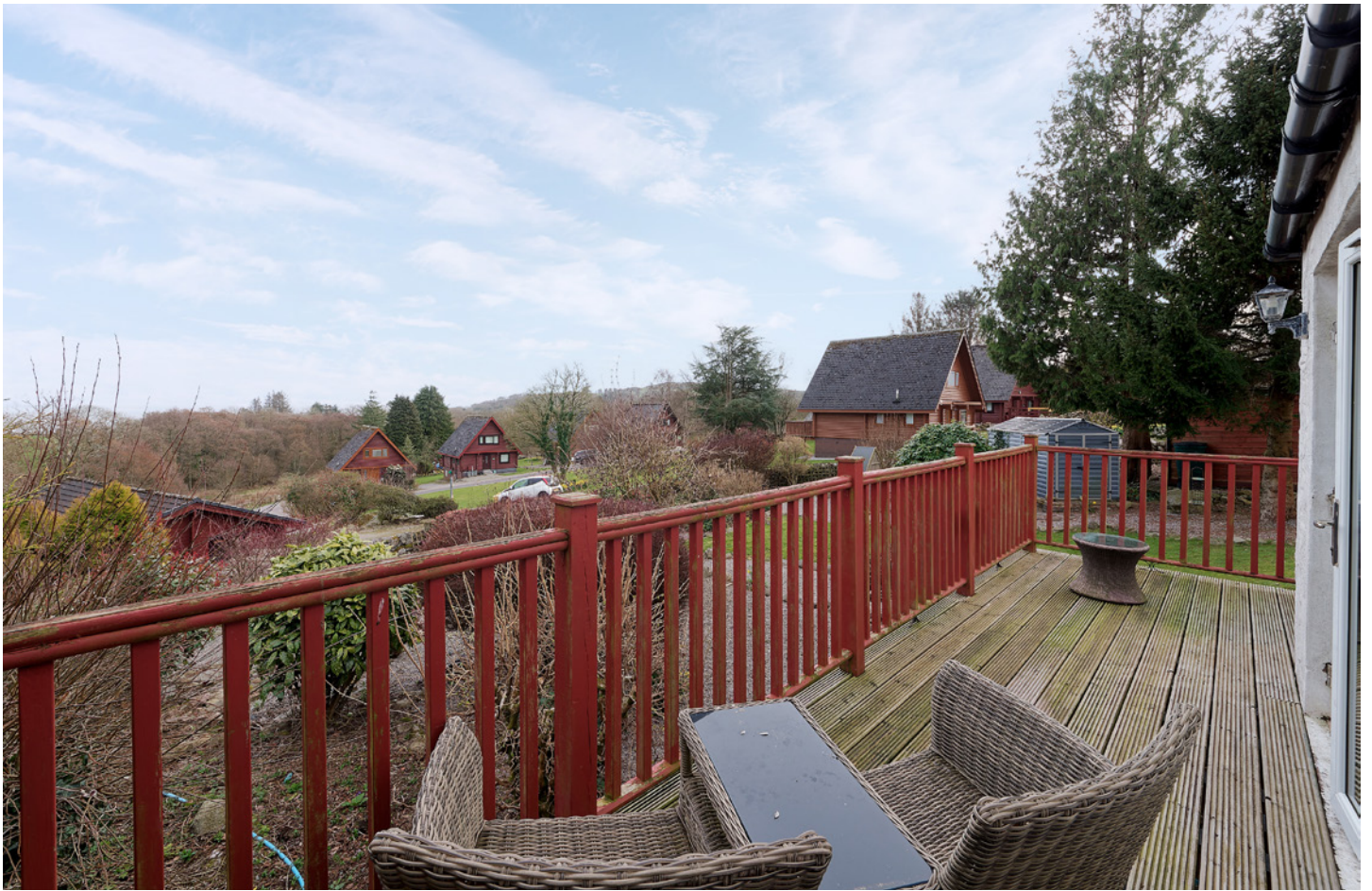
The lounge leads out beautifully onto the balcony, which offers stunning views of the sea.