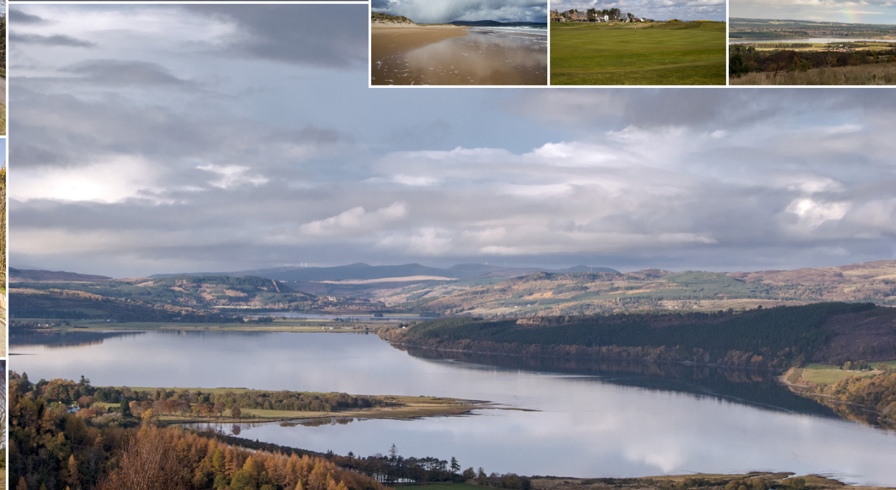
EMBO BEACH NEAR DORCOCH, DORNOCH GOLF COURSE, SKIBO CASTLE AND BALBLAIR DISTILLERY ON DORCHOC FIRTH, DORNOCH FIRTH TOWARDS BONAR BRIDGE