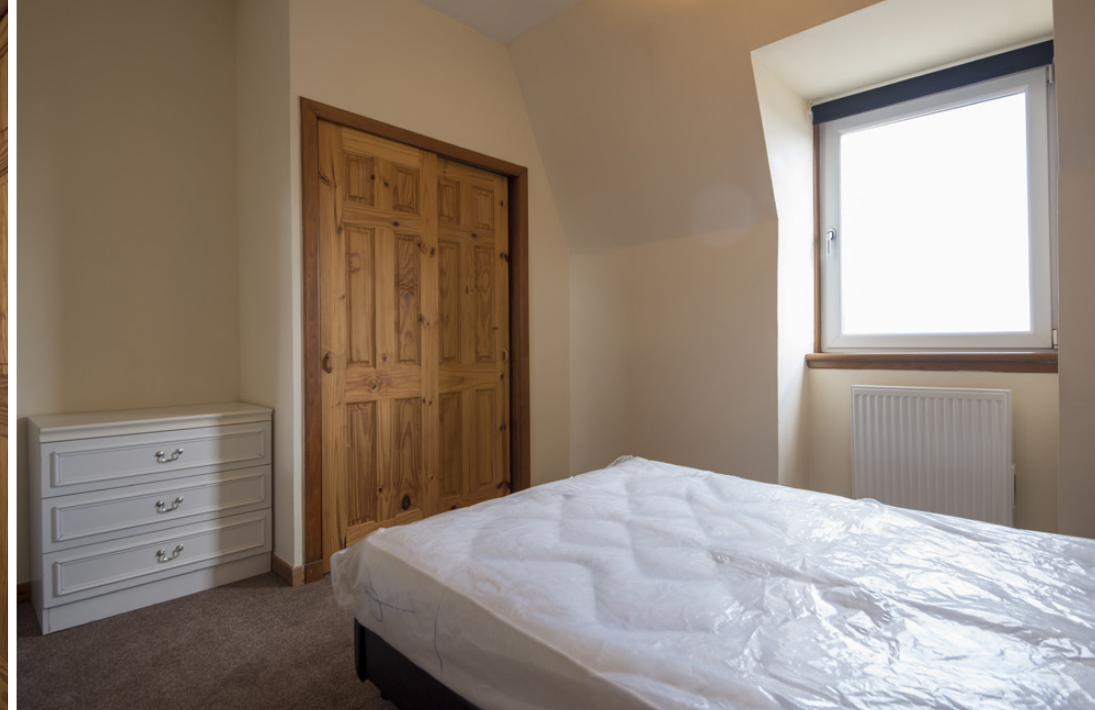
Bathroom Bedroom Two