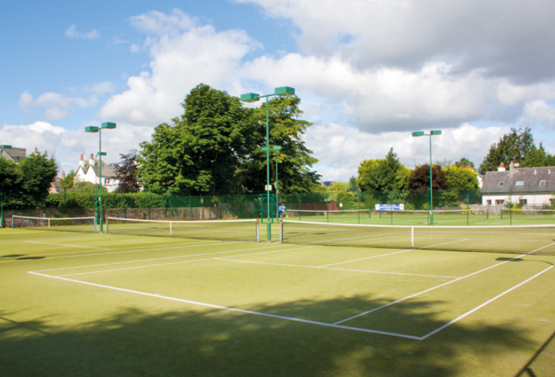
Braid Hills Golf Course, Hermitage Park and Westgarth Tennis Courts