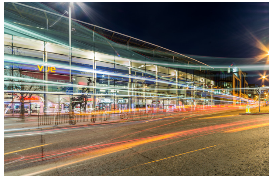
Local area and lifestyle shots of New Town and surrounding area