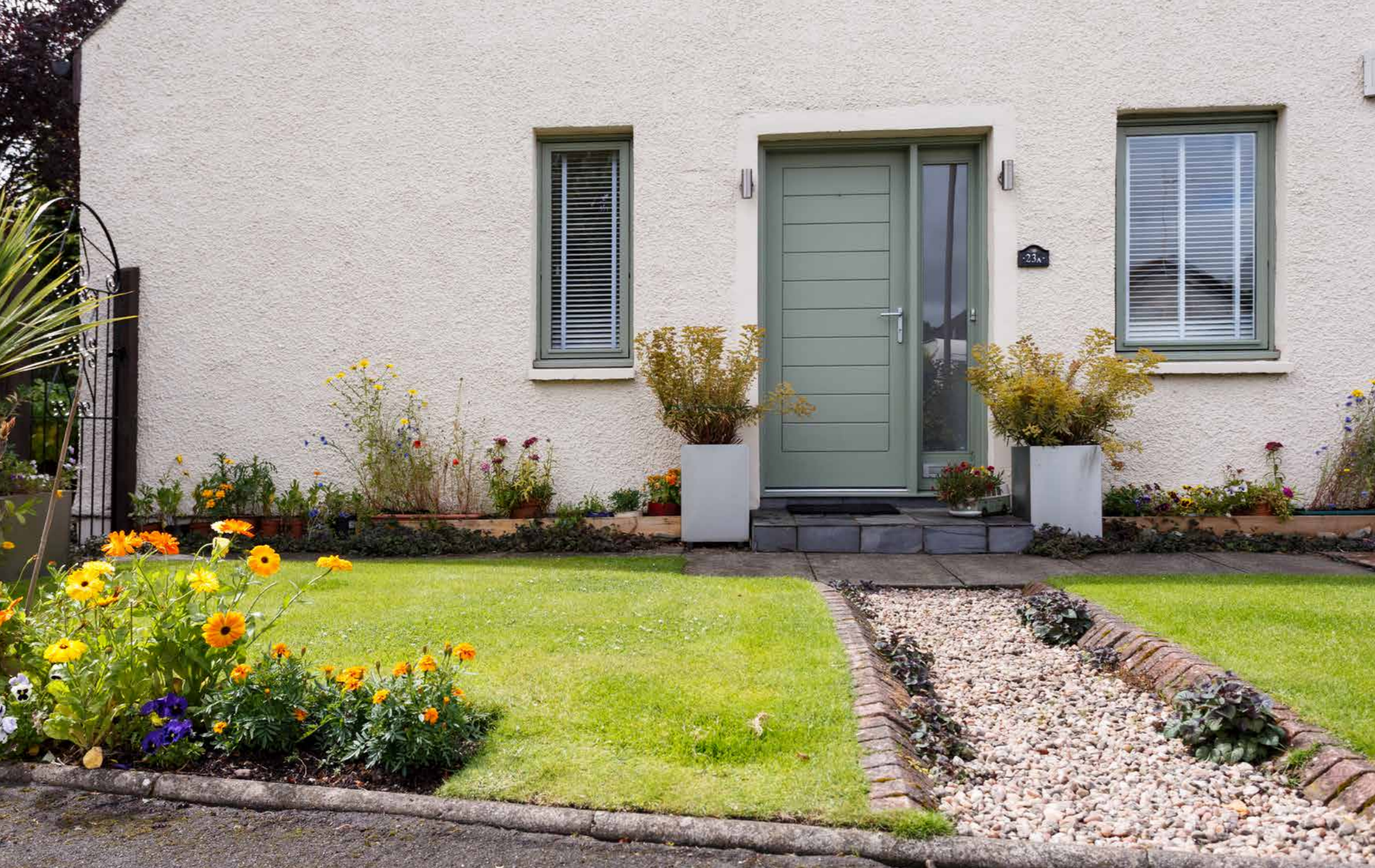
23A The Orchard ORMISTON, EAST LOTHIAN