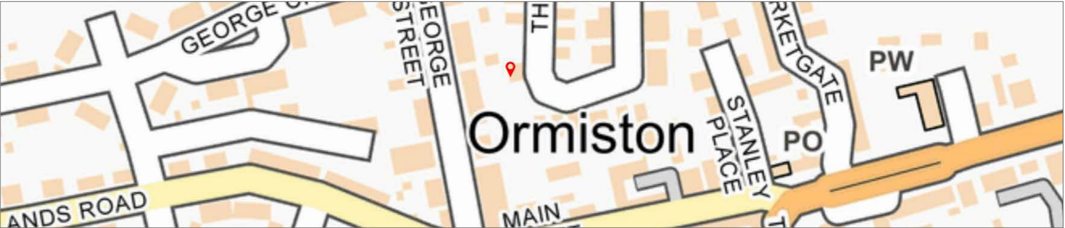
23A The Orchard ORMISTON, EAST LoTHIAN