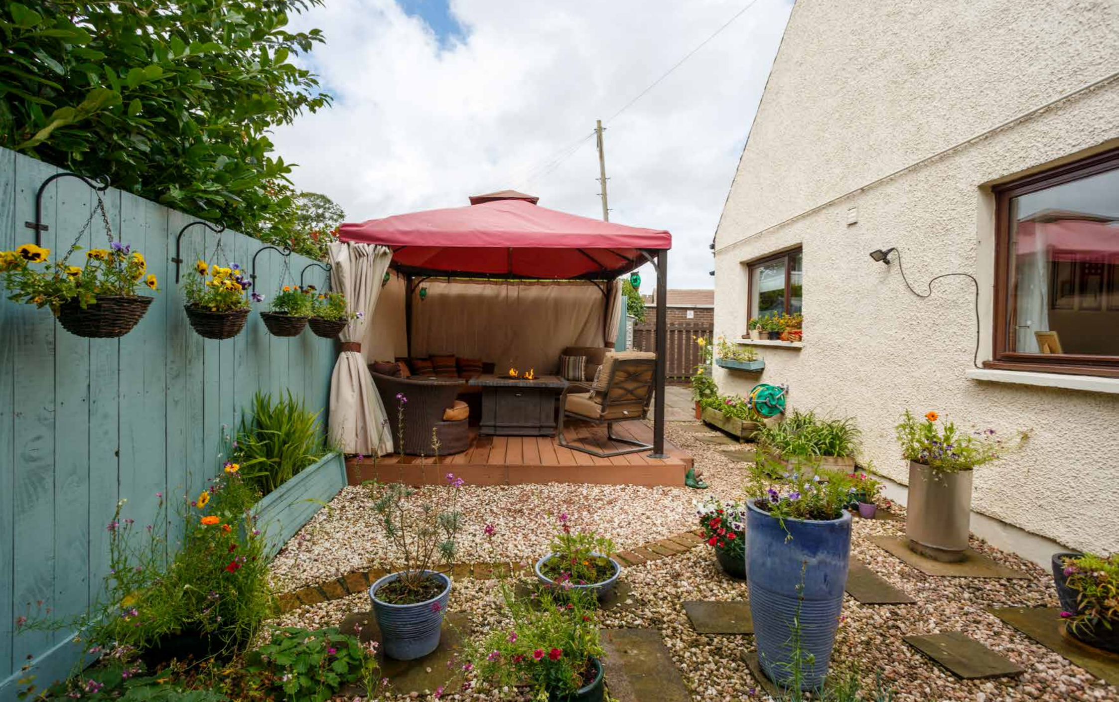
23A The Orchard