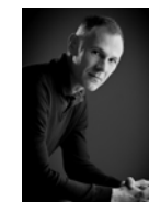
Professional photography ROY GLEN Photographer