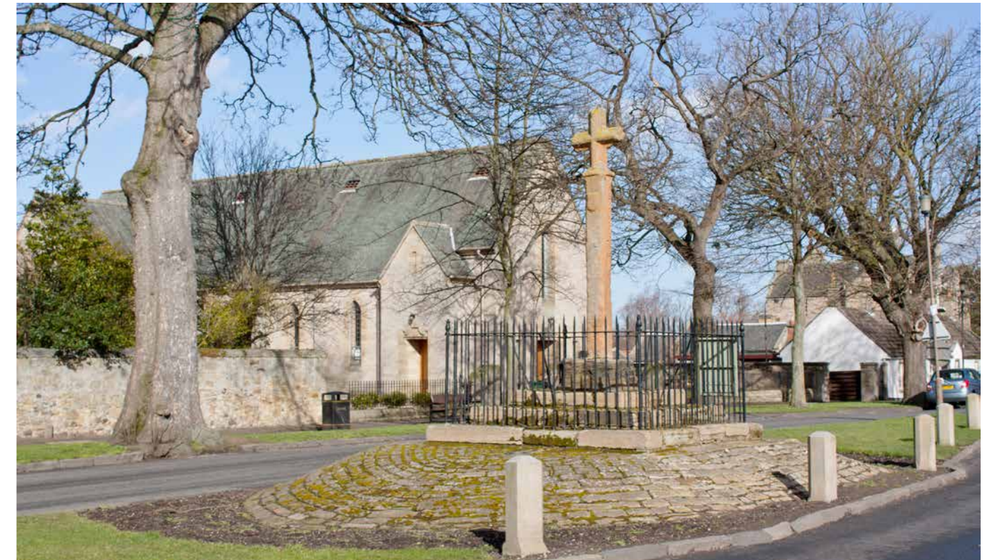
23A The Orchard