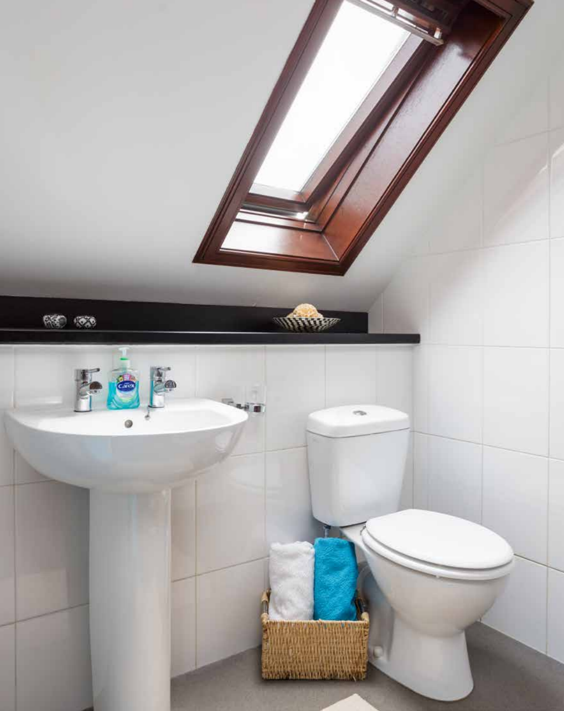
23A The Orchard ORMISTON, EAST LoTHIAN