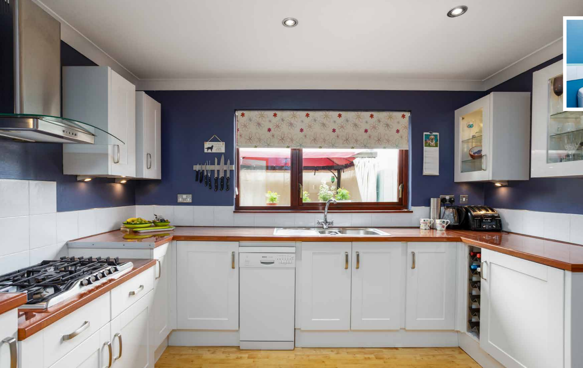
23A The Orchard