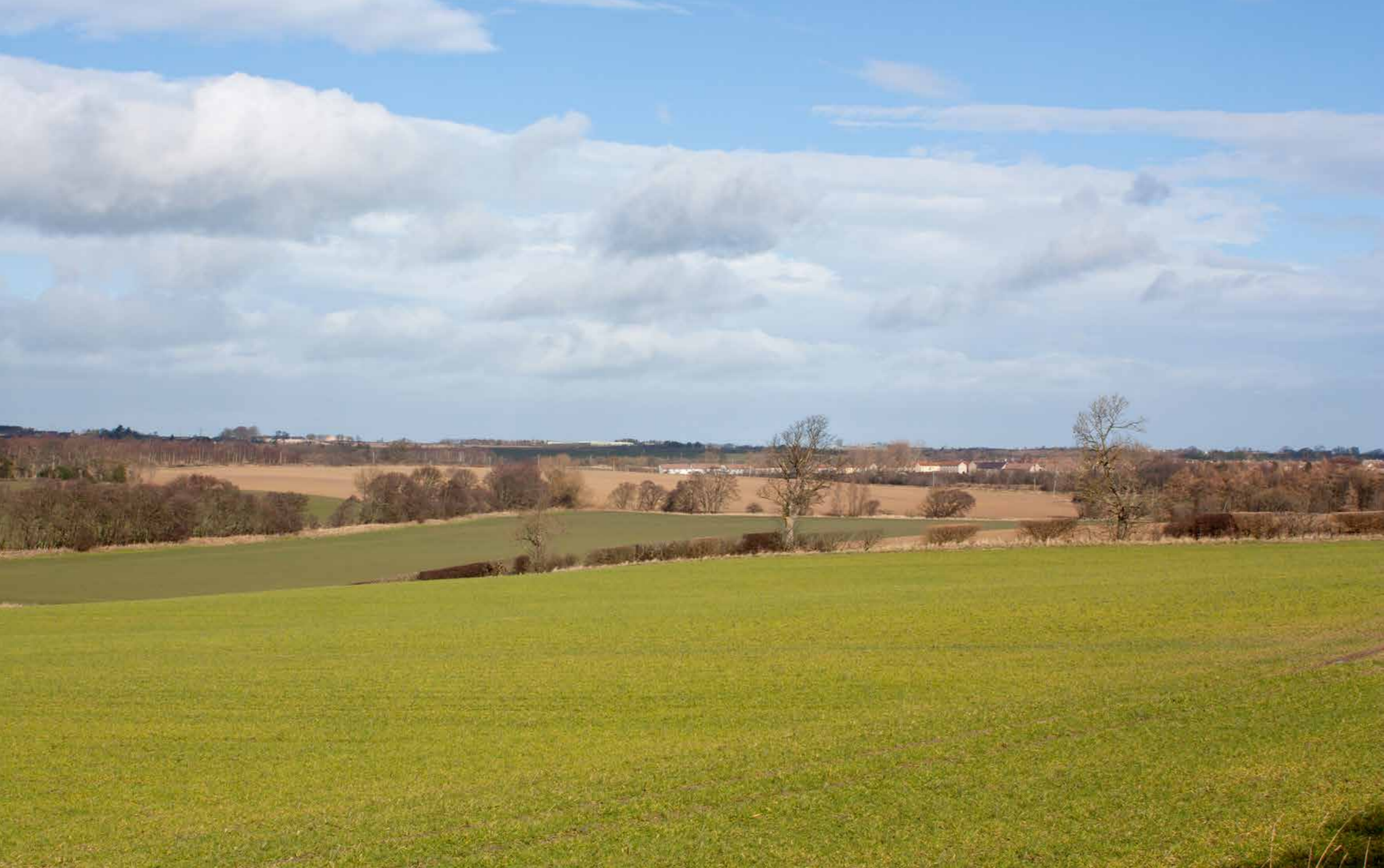
23A The Orchard