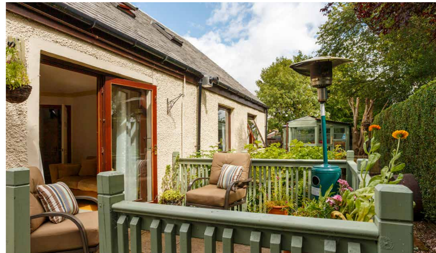
23A The Orchard

This property also benefits from gas central heating, full double glazing and private gardens surrounding the property, including a vegetable patch, greenhouse and patio area to the side, a decked area and bin store to the rear as well as a double driveway to the front, leading to the large single garage with automatic door, allowing for secure off-street parking for up to two cars. Visitors can take full advantage of the unrestricted on-street parking.