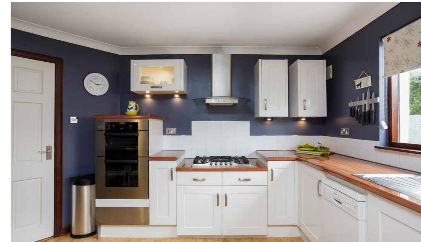
23A The Orchard

There is a dual aspect double bedroom, which is currently used as a family room and provides access to the rear garden. There is also a downstairs cloakroom WC.