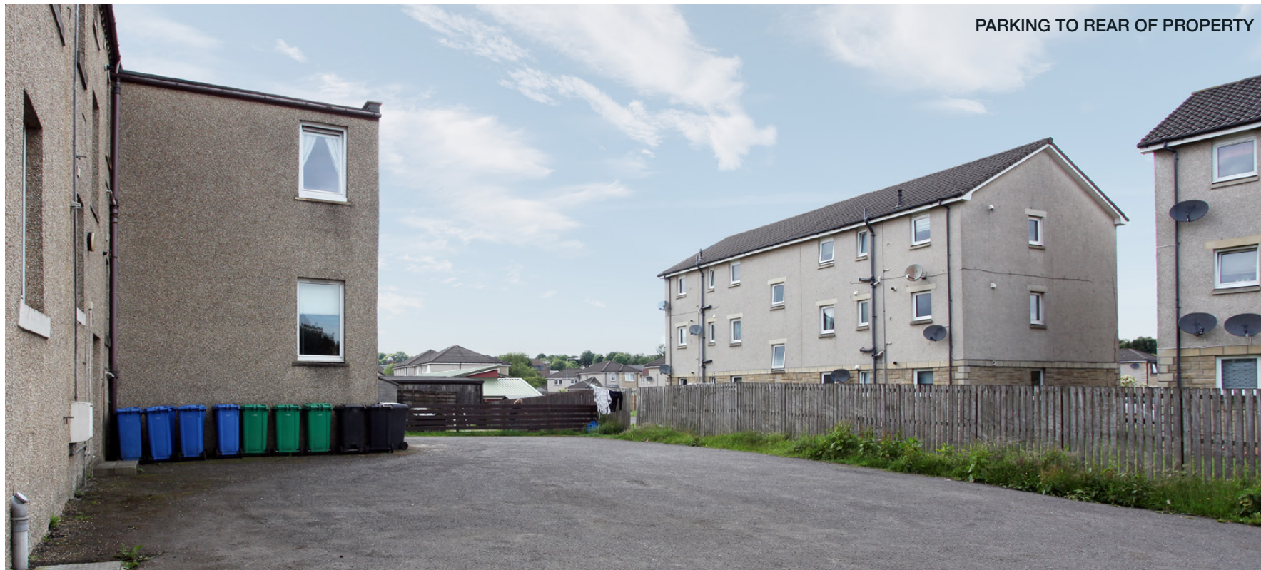
PARKING TO REAR OF PROPERTY