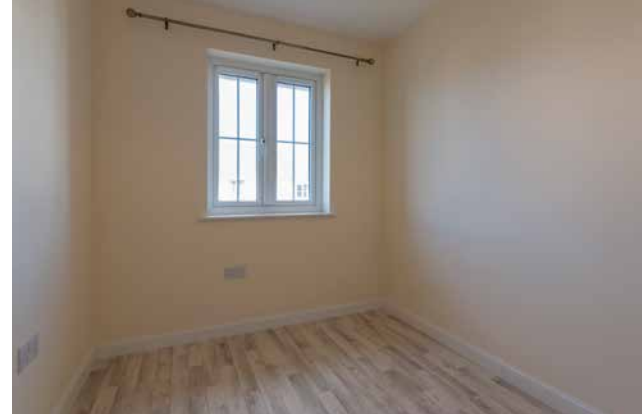
BEDROOMS, BATHROOM & WC