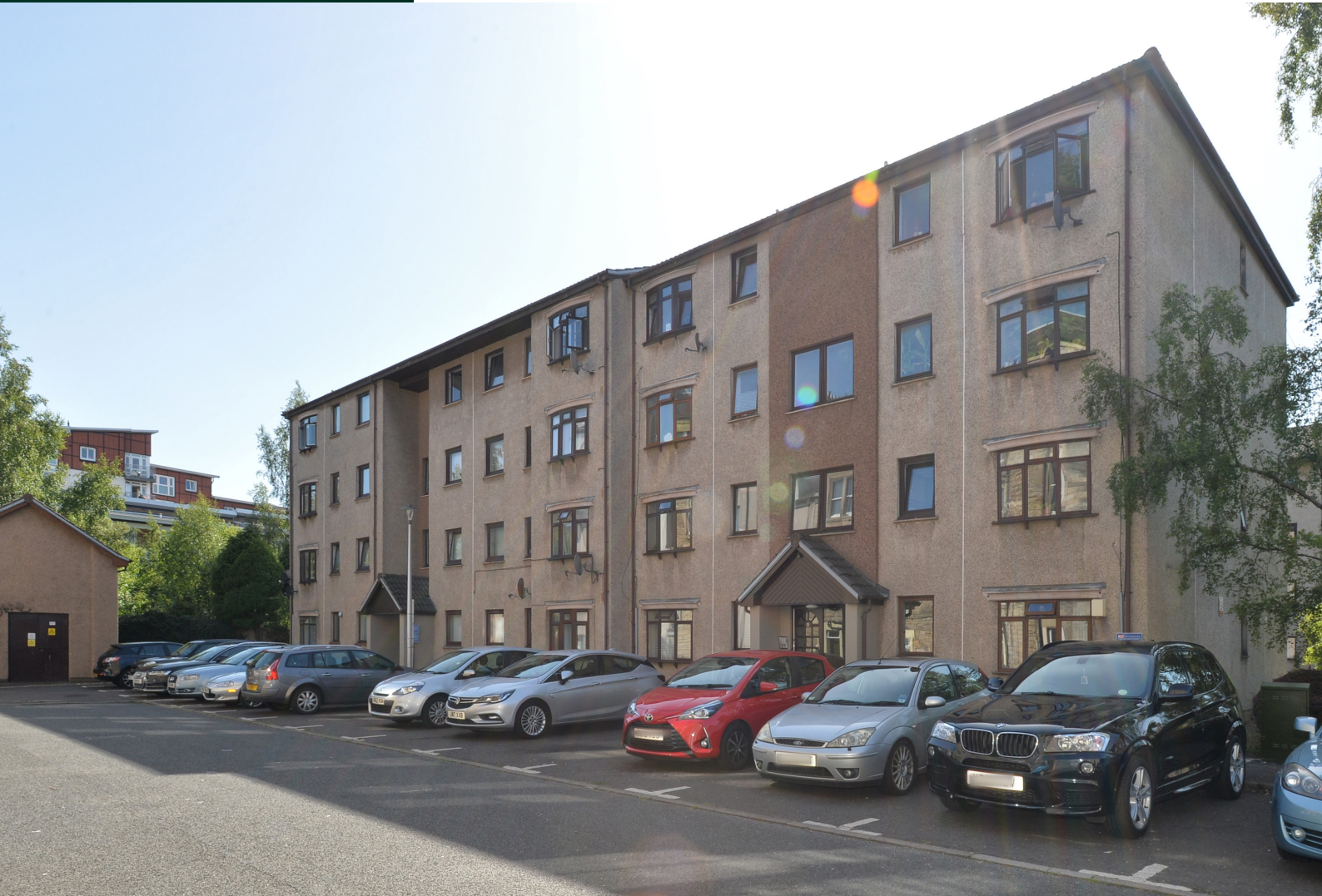
Spacious Modernised Two Bedroom, Second-Floor Flat In Leith