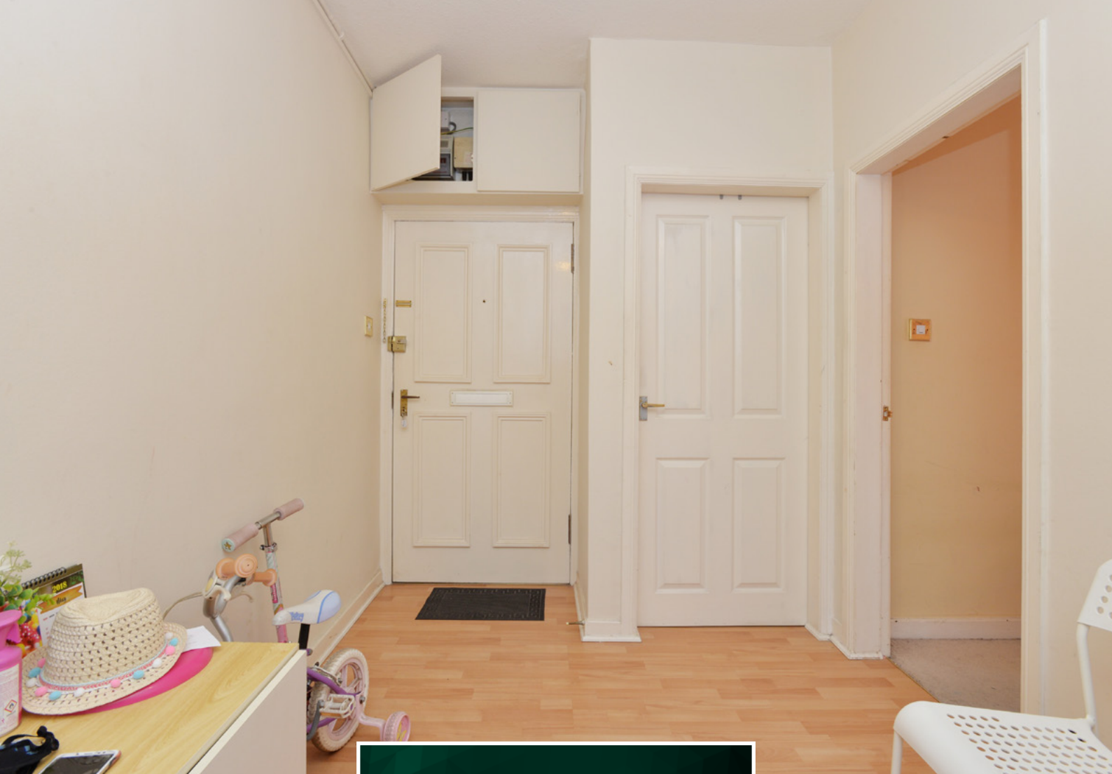
Hall & Bathroom