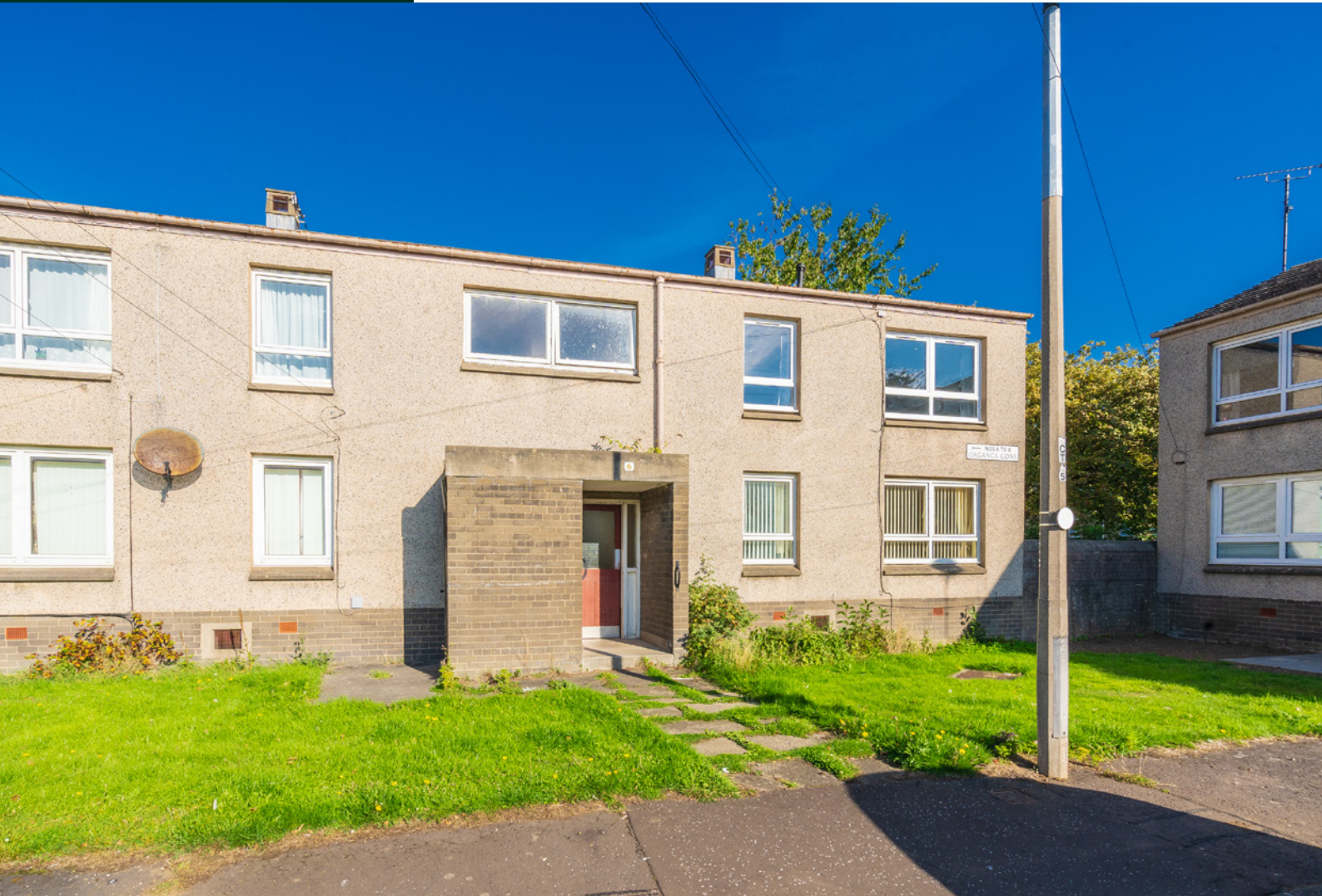
Spacious One Bedroom Flat In Edinburgh's Oxgangs Area