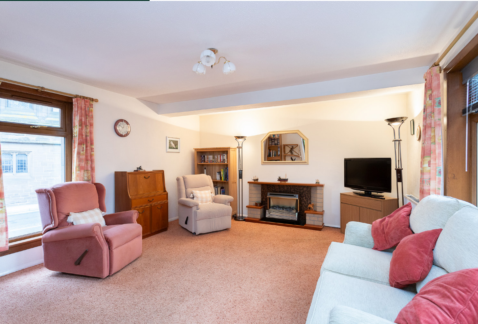
ONE-BEDROOM GROUND FLOOR FLAT