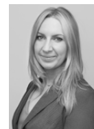
Professional photography LEIGH ROLLO Photographer