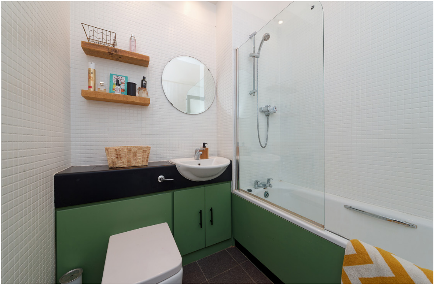
A well-appointed family bathroom completes the internal accommodation, featuring a full-sized bath, elegant tiling, and modern sanitaryware.