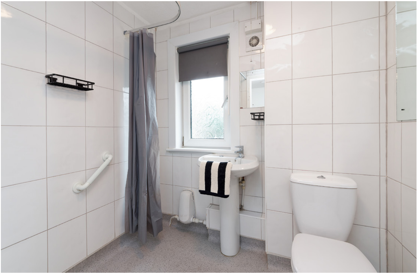
The tiled family bathroom is bright and fresh, finished as a wet room, with a white suite and electric shower. There are ample cupboard spaces to help keep everything in its place.