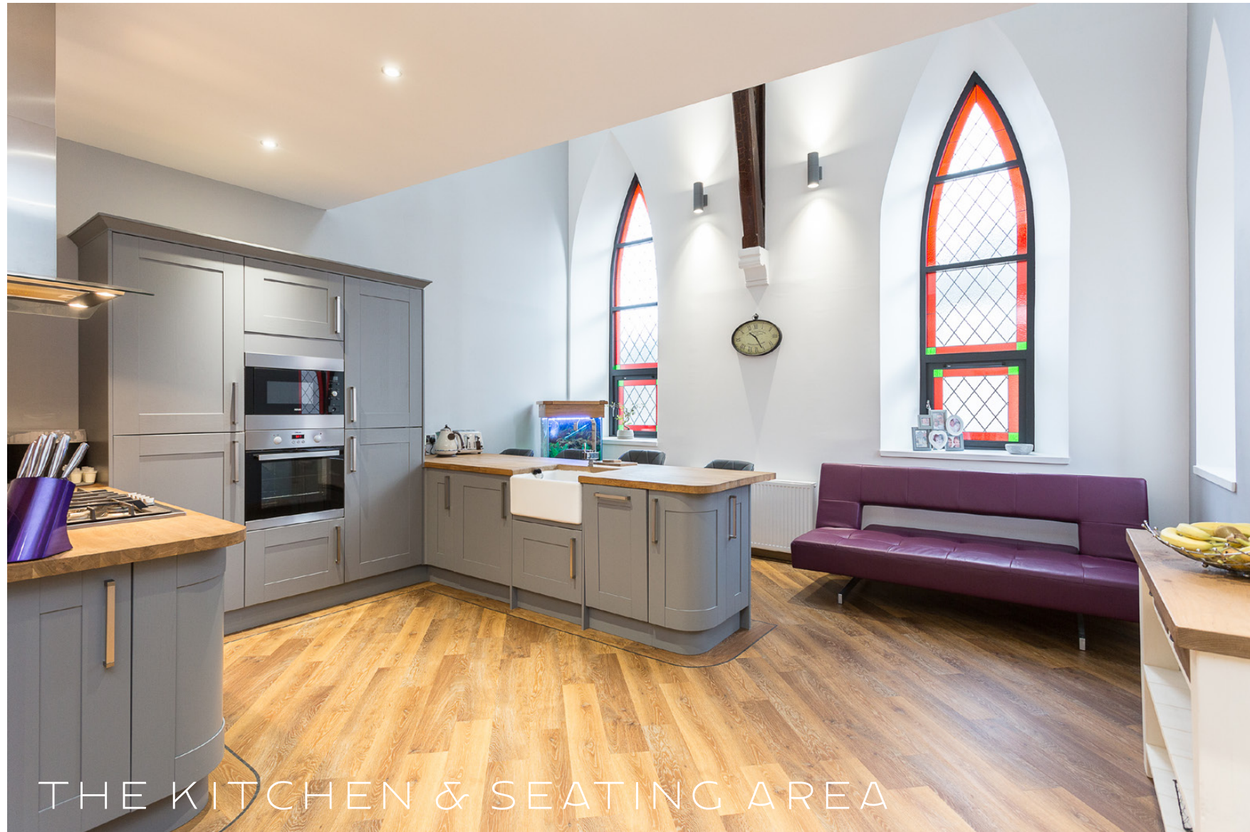
THE KITCHEN & SEATING AREA