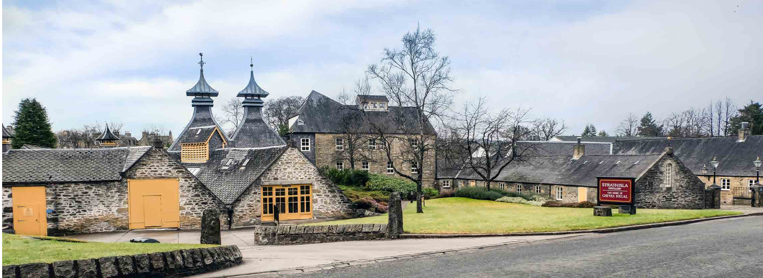
Auchindoon Castle, Keith Old Brig, Keith Town Station & Keith Strathisla Distillery

Keith is situated in a stunning North-East location at the start of Scotland's Famous Malt Whiskey Trail. Keith and the surrounding villages, and hamlets were most likely built to house the workers of the nearby mills & distilleries that are located in the heart of the Speyside