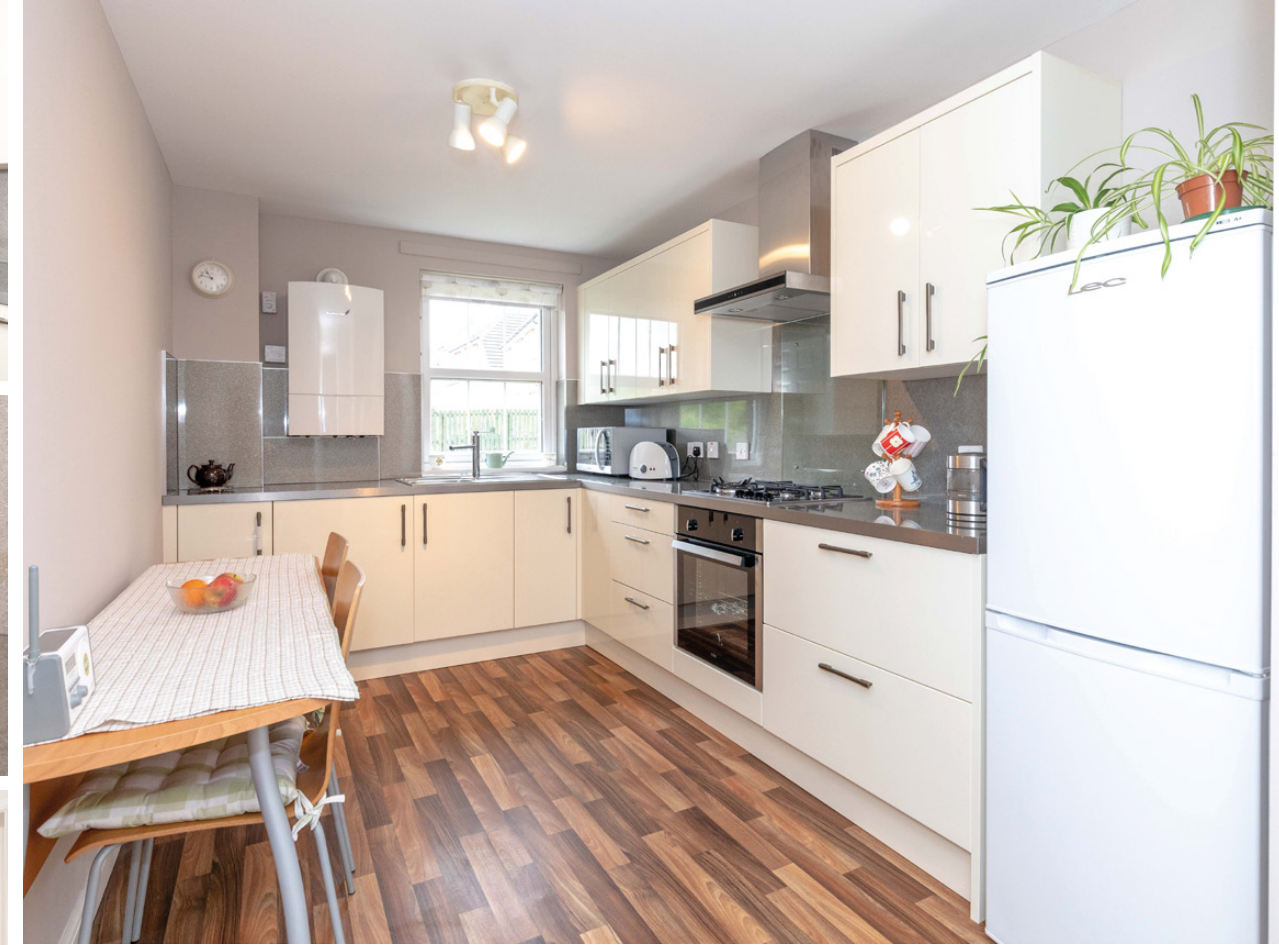
Lounge, Kitchen & Hallway