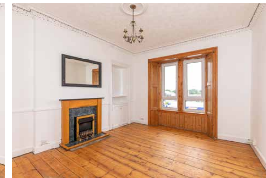
“SPACIOUS TWO BEDROOM IN MUSSELBURGH”