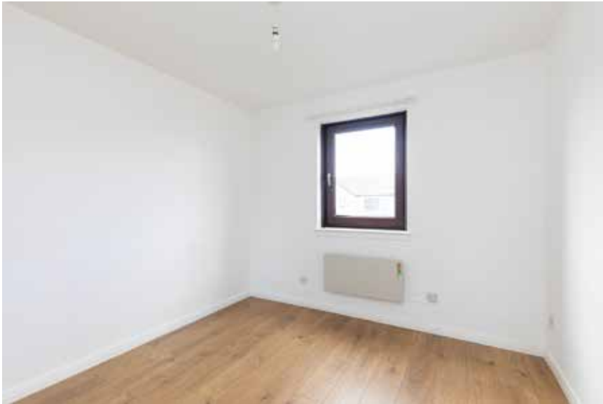
Bedroom & Bathroom