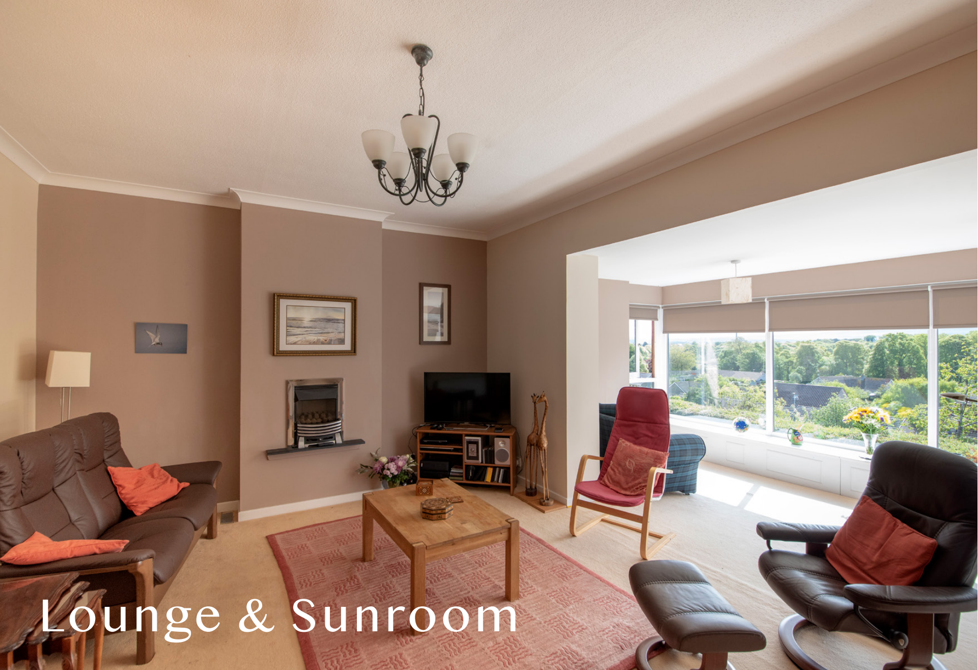
Lounge & Sunroom