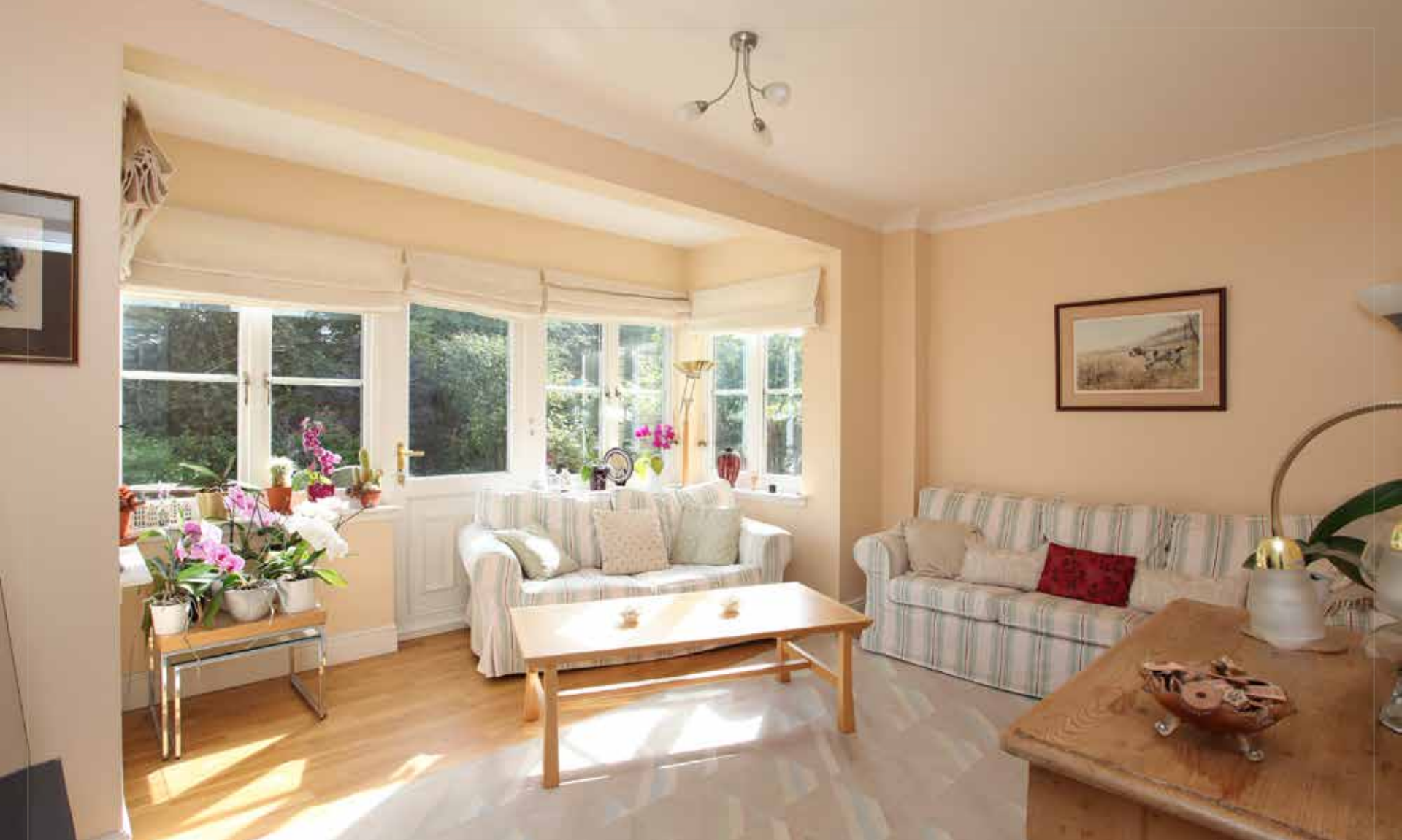
A large family room/study completes the accommodation on the ground floor. This room would be ideal for those working from home.