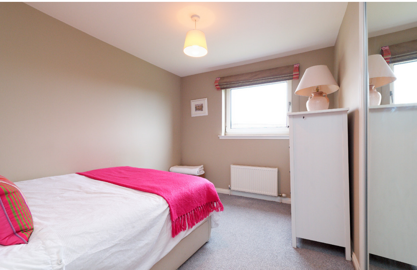
Bedroom 1 & En-Suite