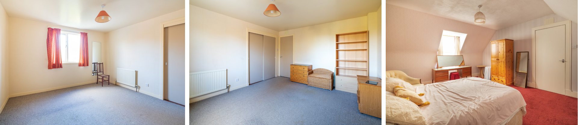
BEDROOMS, BATHROOM & WC