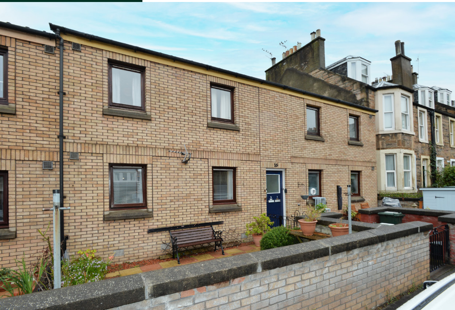
Beautifully presented Two Bed Ground Floor Flat In Edinburgh's Popular Leith Links