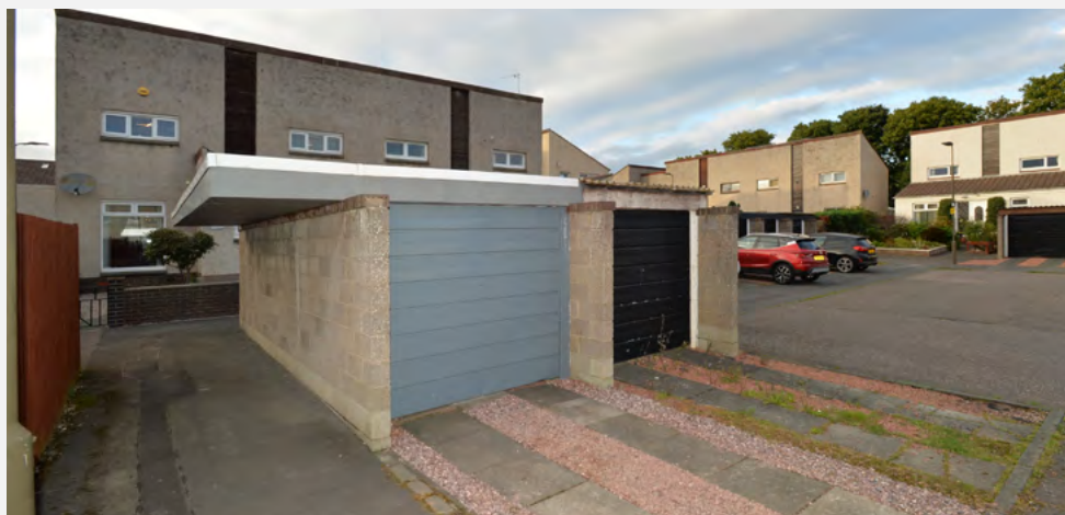
garden & garage