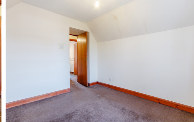
bedrooms & bathroom