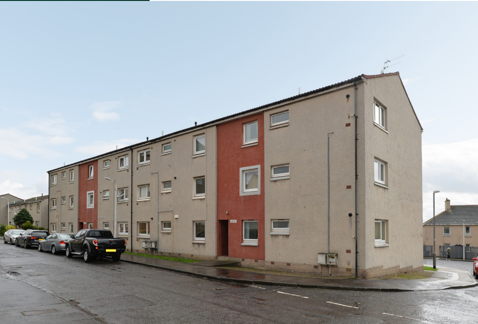
Two-bedroom ground-floor apartment with sea views