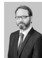
Professional photography CRAIG DEMPSTER Photographer