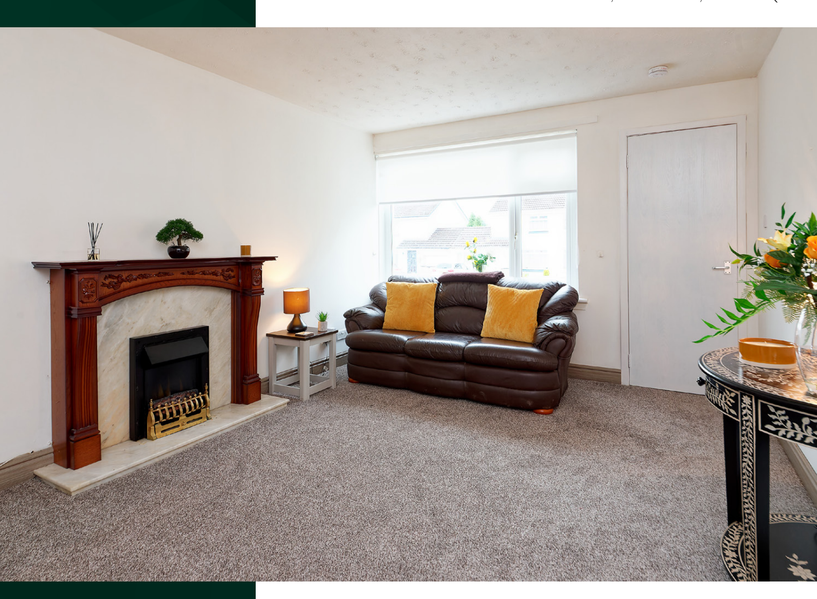
EXCELLENT TWO-BED LOWER COTTAGE FLAT