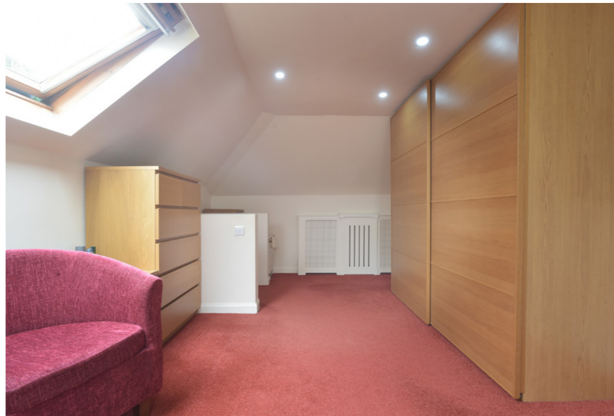
On the first floor there is a large master bedroom with fitted integrated wardrobes and a large en-suite shower room.