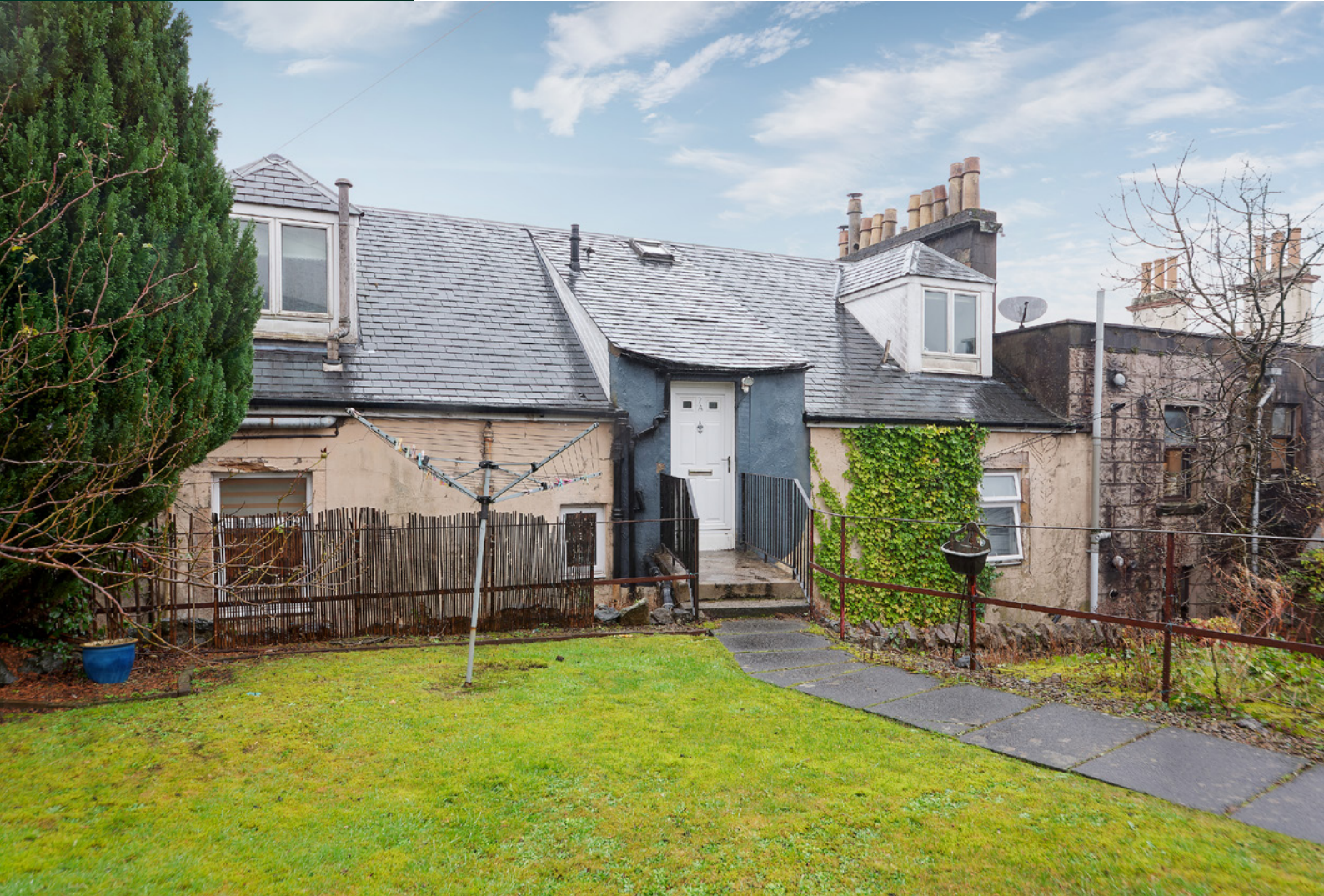
Charming Two Bedroom Upper Cottage Flat in Beith