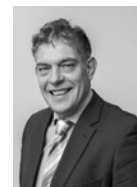
Professional photography MARK BRYCE Photographer