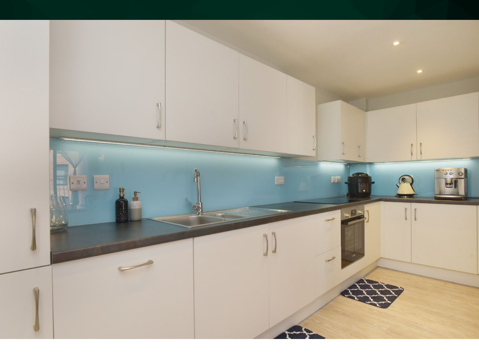
There is a wonderful kitchen with a good selection of stylish units and integral appliances.