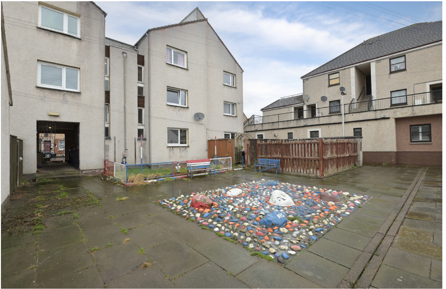
Externally, the property benefits from a private garden and on-street parking.