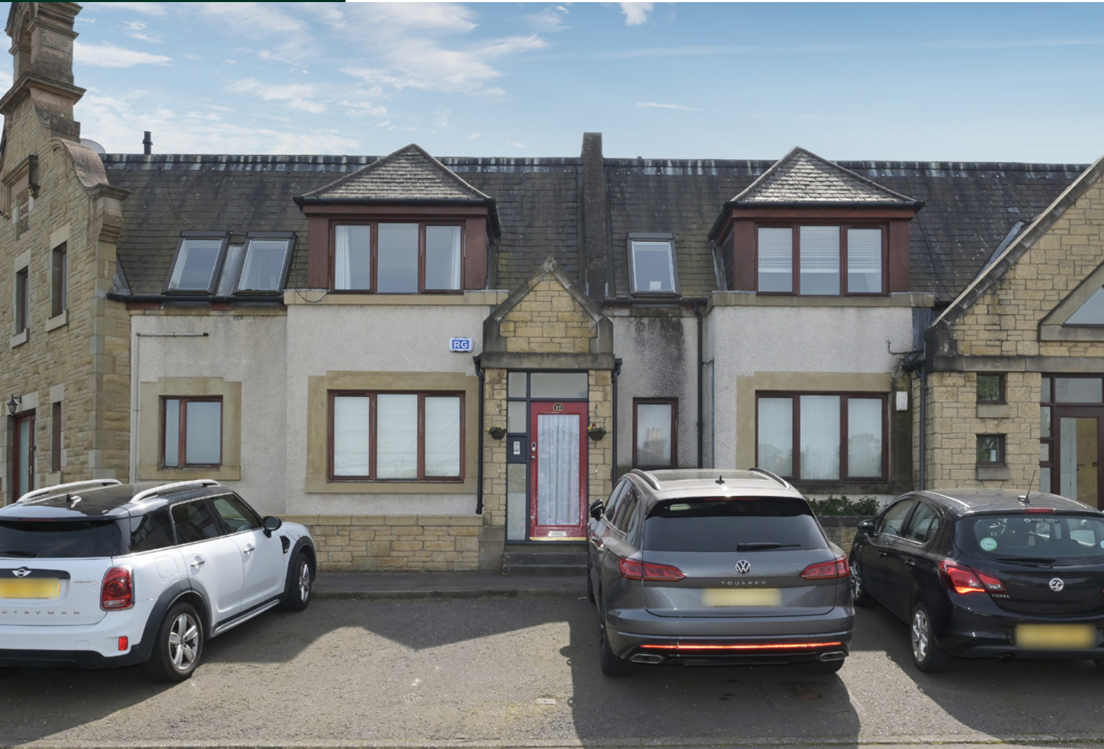
Beautifully Presented Two-Bedroom Main Door Flat – Baird Road, Ratho