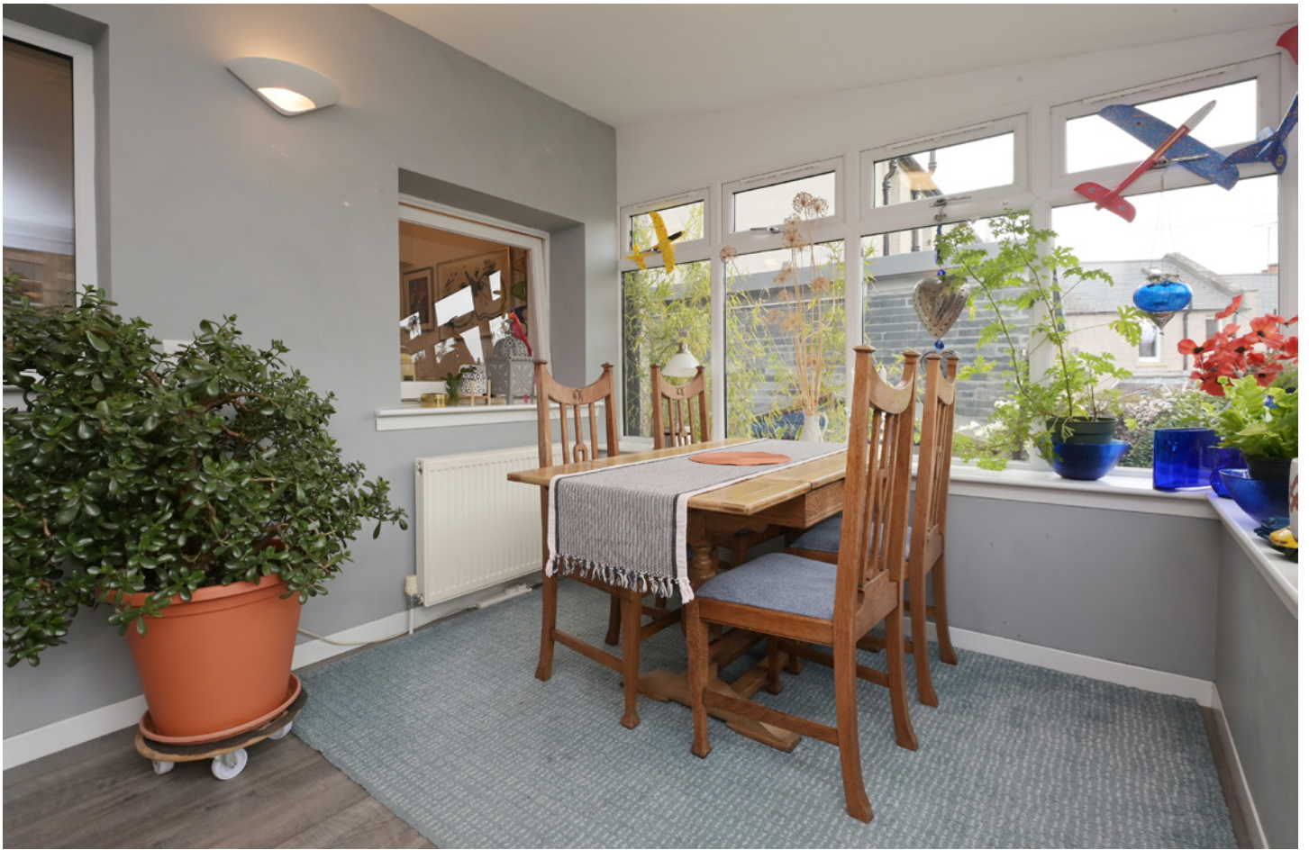
A door from the kitchen leads directly into a charming sun room overlooking the rear garden, providing an ideal additional sitting or dining area.