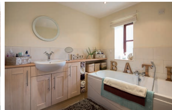
Bedroom1 and En-suite