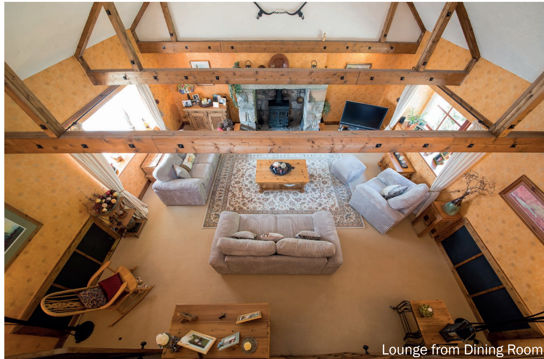
Lounge from Dining Room

The sanitary-ware in each of the bathrooms is of a high quality, modern with complementary tiling and quality fittings and a beautiful roll top bath in the main bathroom.