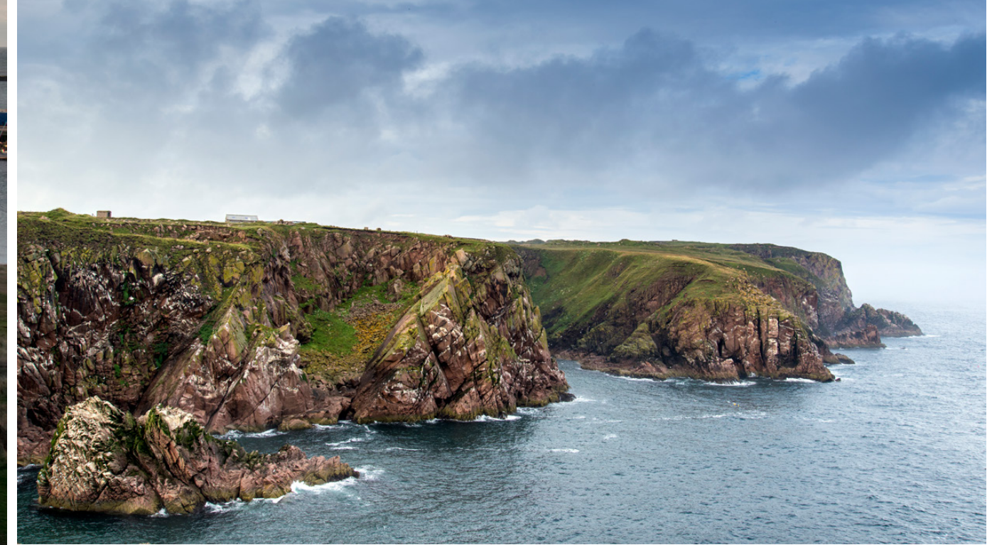
PETERHEAD HARBOUR, RATTRAY HEAD, BUCHAN NESS & BULLERS O BUCHA