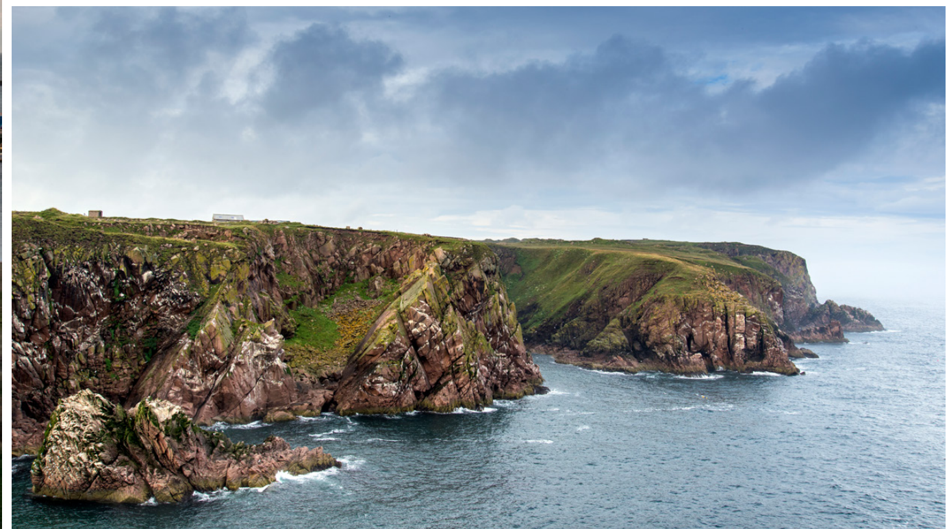
PETERHEAD HARBOUR, RATTRAY HEAD, BUCHAN NESS & BULLERS O BUCHAN