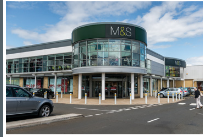
The nearby Craigleith Retail Park & The property exterior