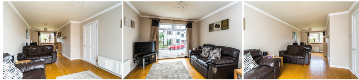
LOUNGE/DINING AREA & KITCHEN