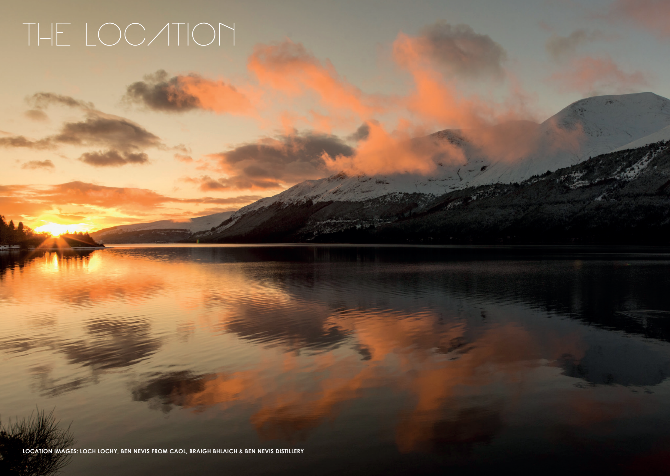
LOCATION IMAGES: LOCH LOCHY, BEN NEVIS FROM CAOL, BRAIGH BHLAICH & BEN NEVIS DISTILLERY