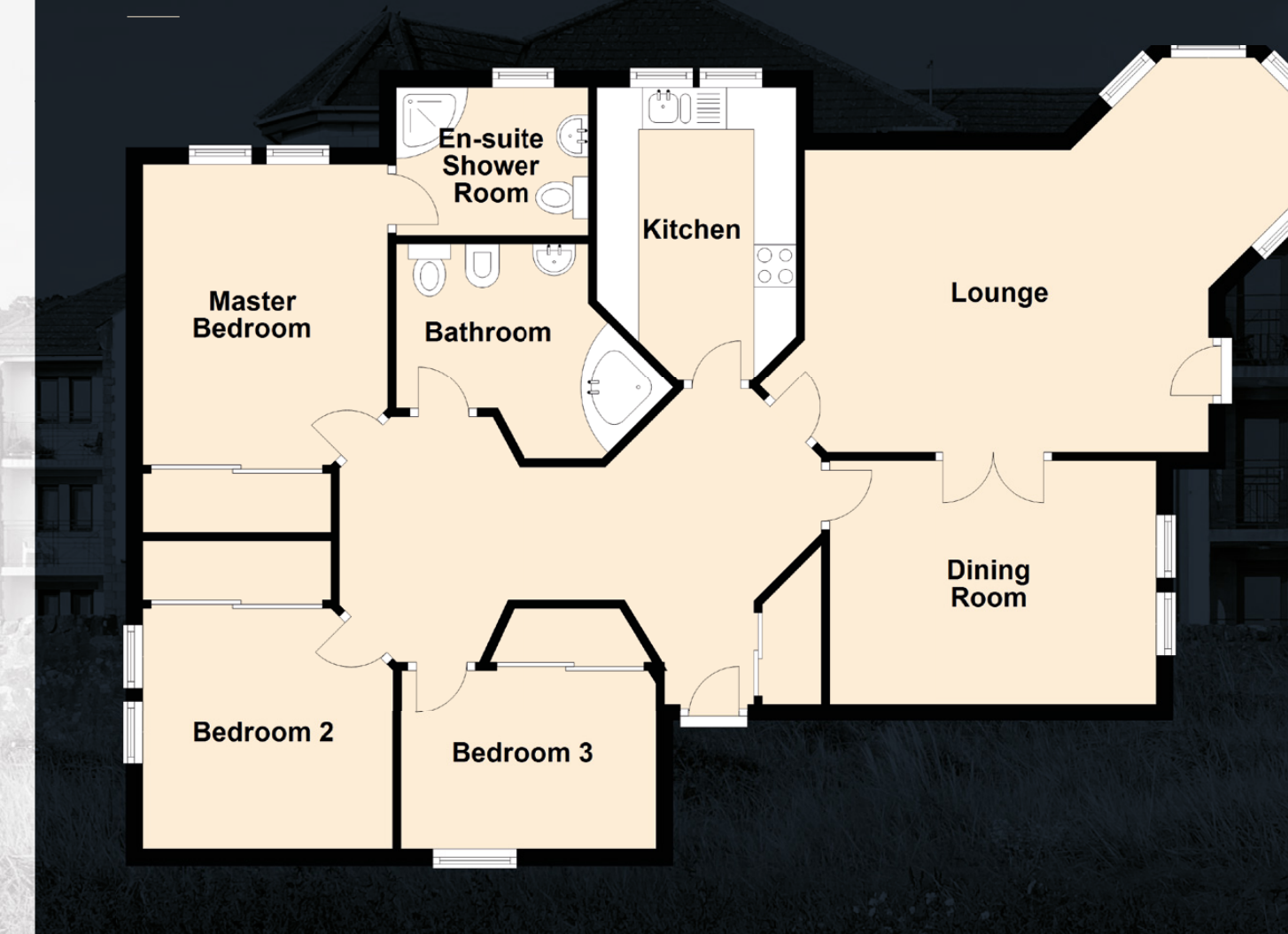
FLOOR PLAN, DIMENSIONS & MAP