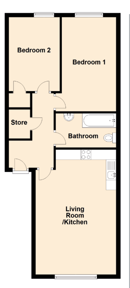
21A FLAT 4