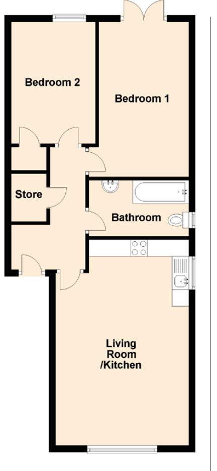
21B FLAT 1