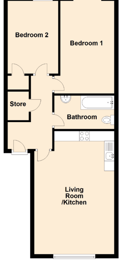
21A FLAT 2