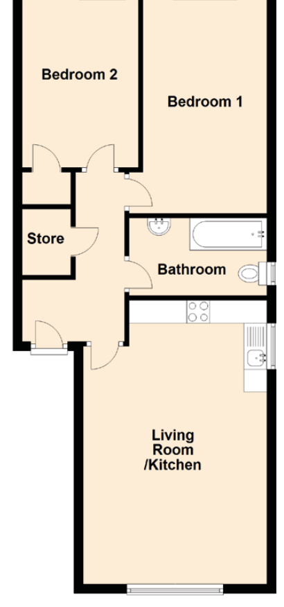
21B FLAT 3