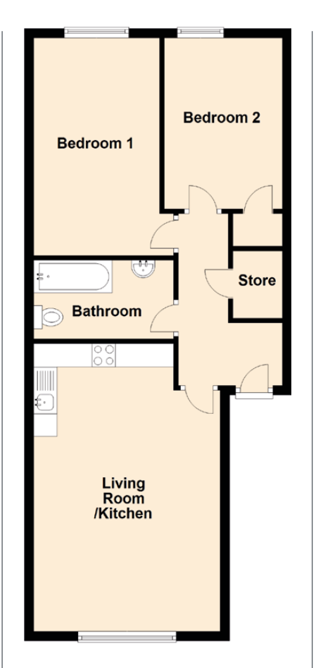
21A FLAT 3 21B FLAT 4