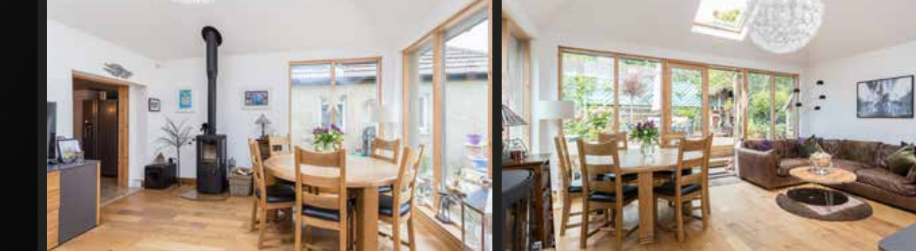
"...ONE LARGE OF THE MAIN FEATURES OF THE HOUSE IS THE GARDEN-ROOM TO THE REAR WHERE YOU CAN ENJOY RELAXING OR ENTERTAINING ..."