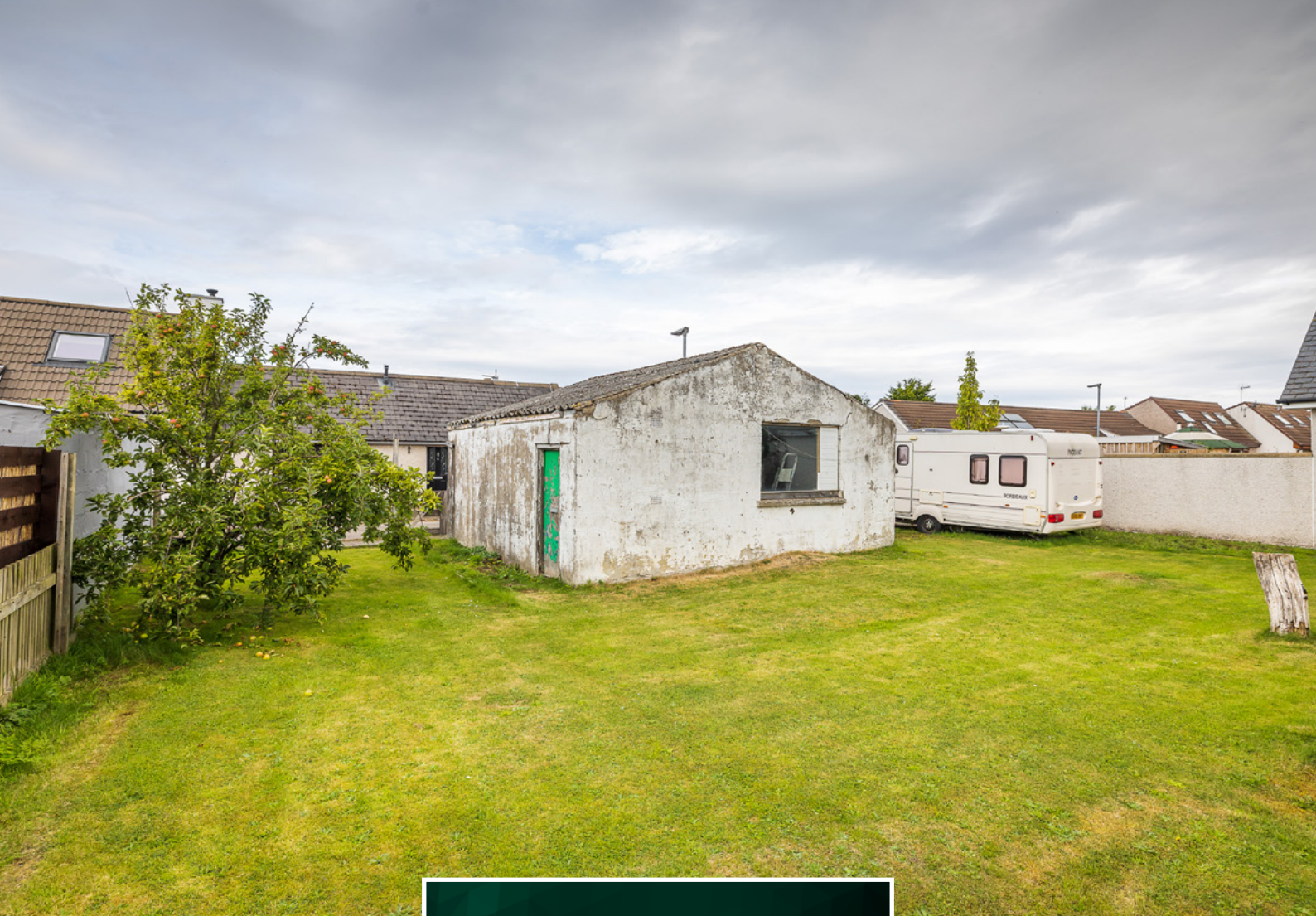
Garden & Garage