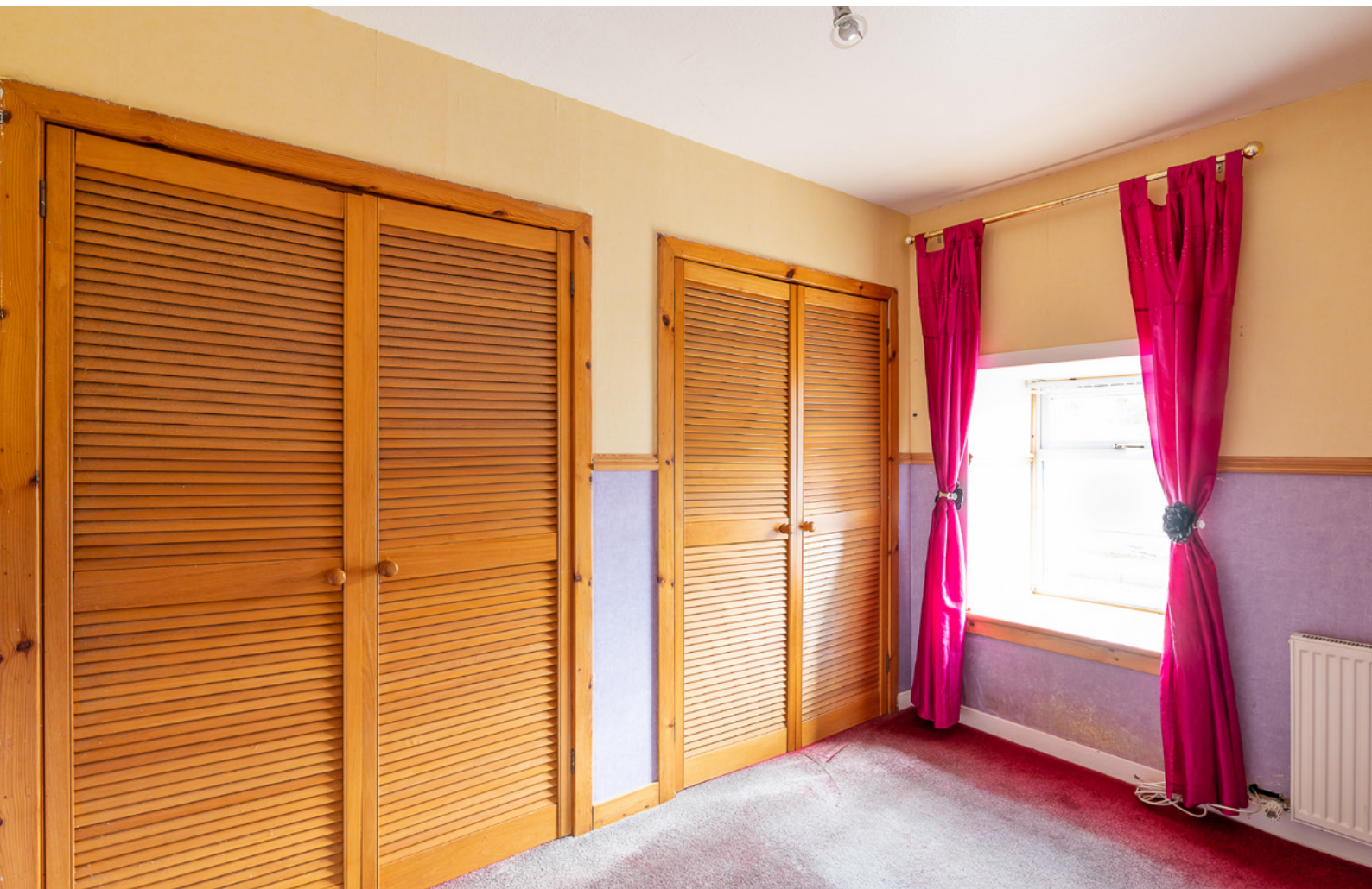
Bedroom 2 & 3