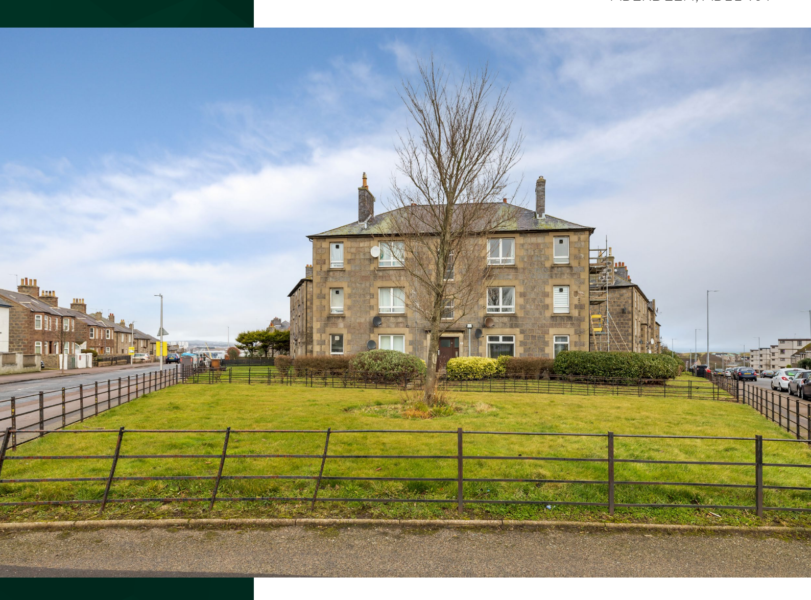
TWO BEDROOM APARTMENT IN THE THRIVING AREA OF TORRY