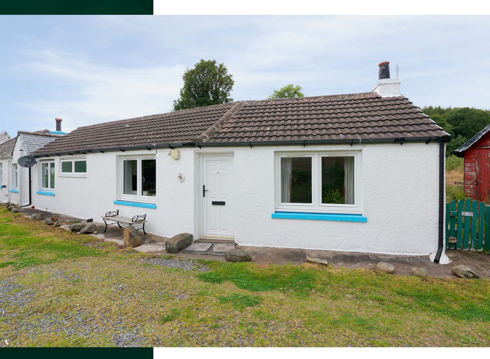
THIS PROPERTY IS SUBJECT TO A BUYERS PREMIUM

7 SMITHY LANE, LUCE, NEWTON STEWART, DG8 0AN