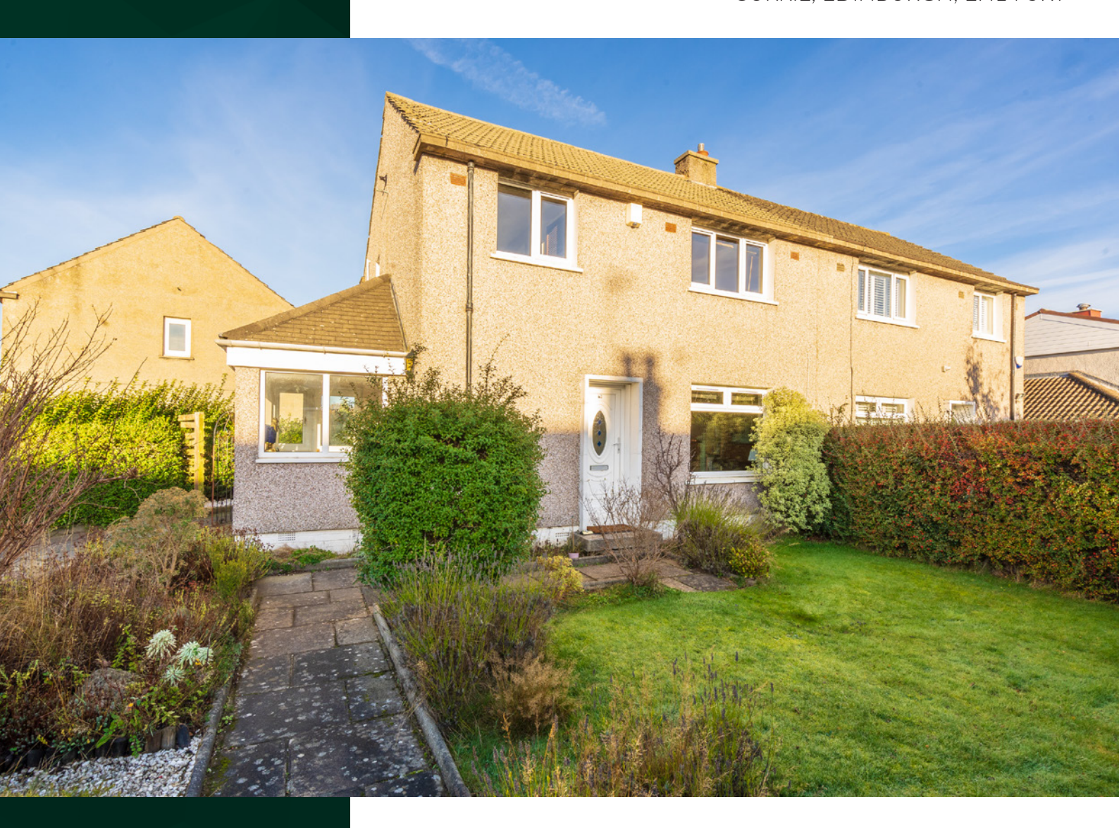
Spacious Three Bed Semi Detached Home In Edinburgh's Popular Area Of Currie