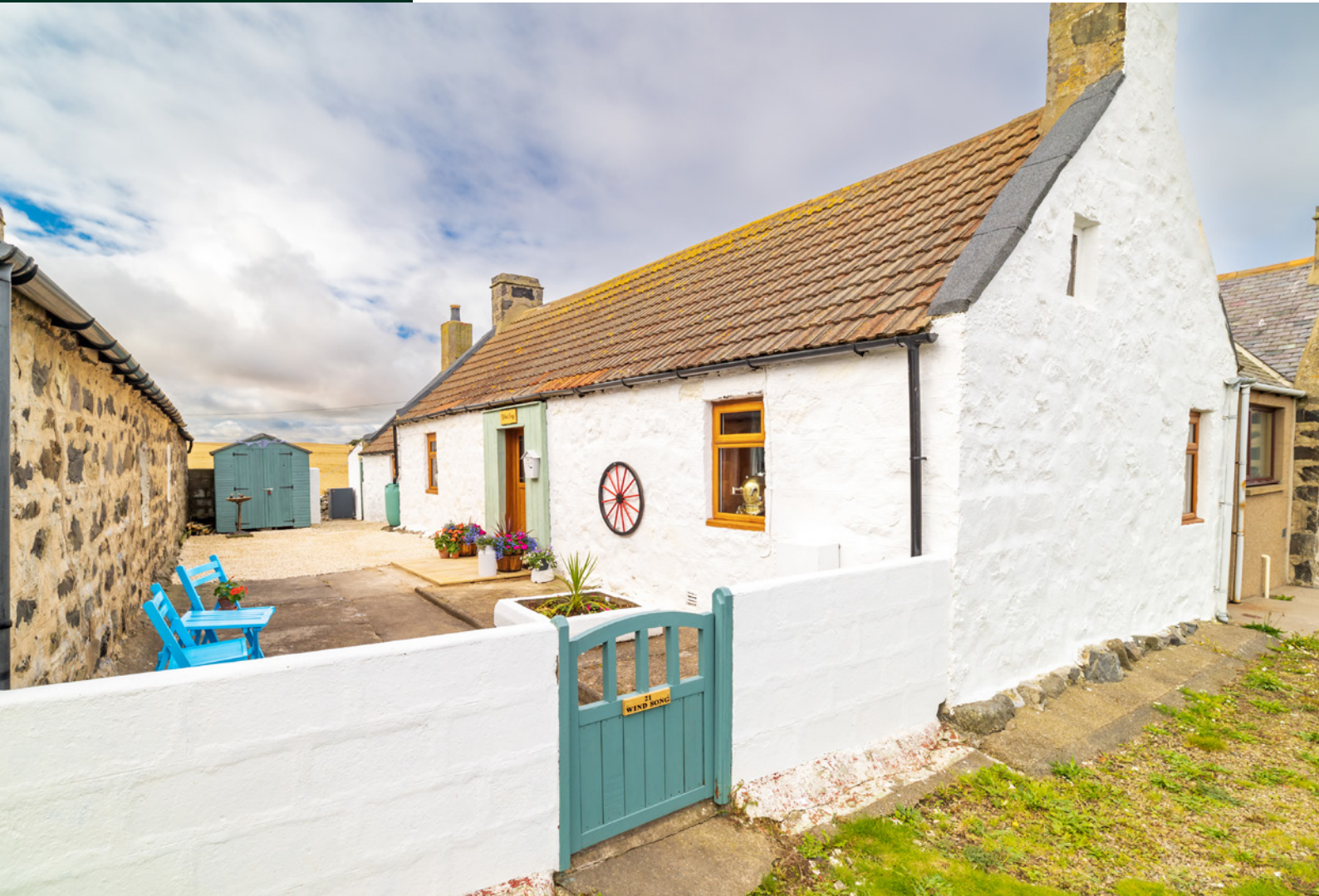
Traditional two-bedroom detached Fisher Cottage in a tranquil seaside village